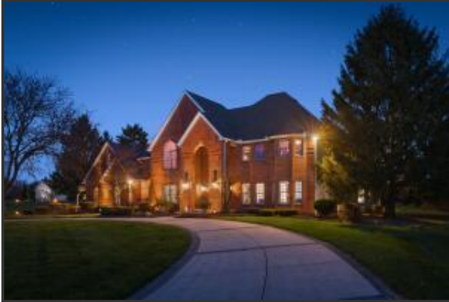
046 Taylor Corners Cir - 009