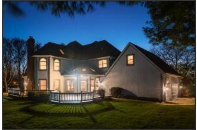
048 Taylor Corners Cir - 017