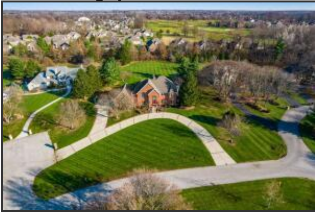
041 Taylor Corners Drone 003