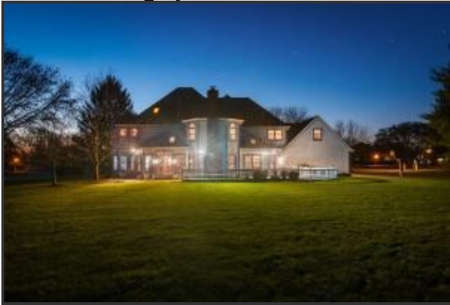
049 Taylor Corners Cir - 021