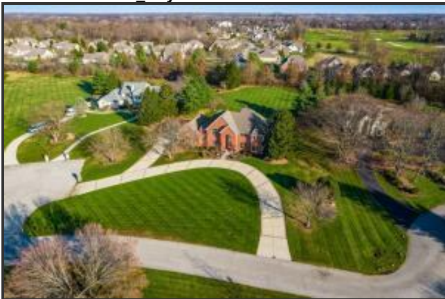
042_ Taylor Corners Drone 004