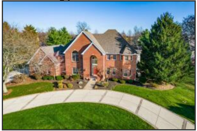
039 Taylor Corners Drone 001-2