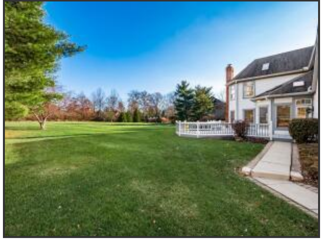
036_ 1640 Taylor Corners 099-2