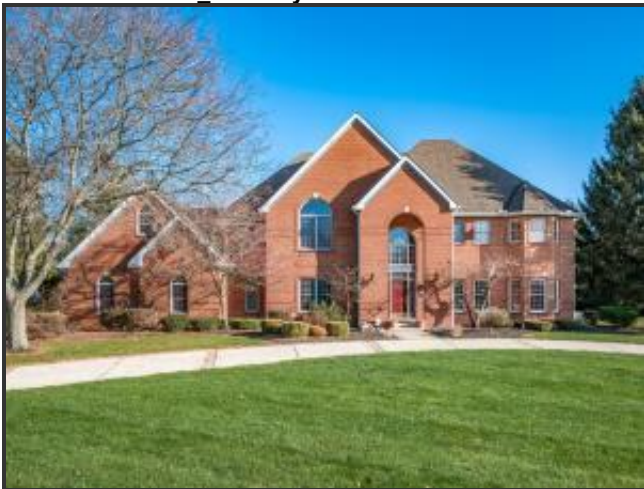
002_ 1640 Taylor Corners 097-2