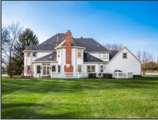
037_ 1640 Taylor Corners 100-2