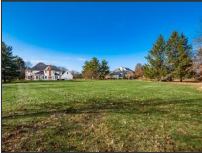
038_ 1640 Taylor Corners 101-2