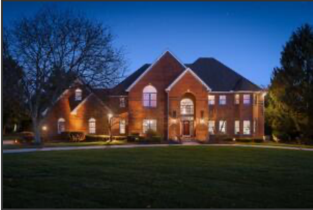
045_ Taylor Corners Cir - 005