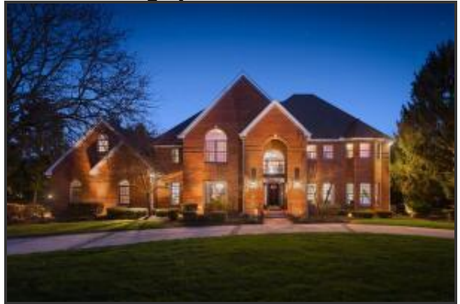
047_ Taylor Corners Cir - 013